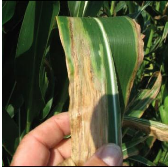
Goss' wilt of maize