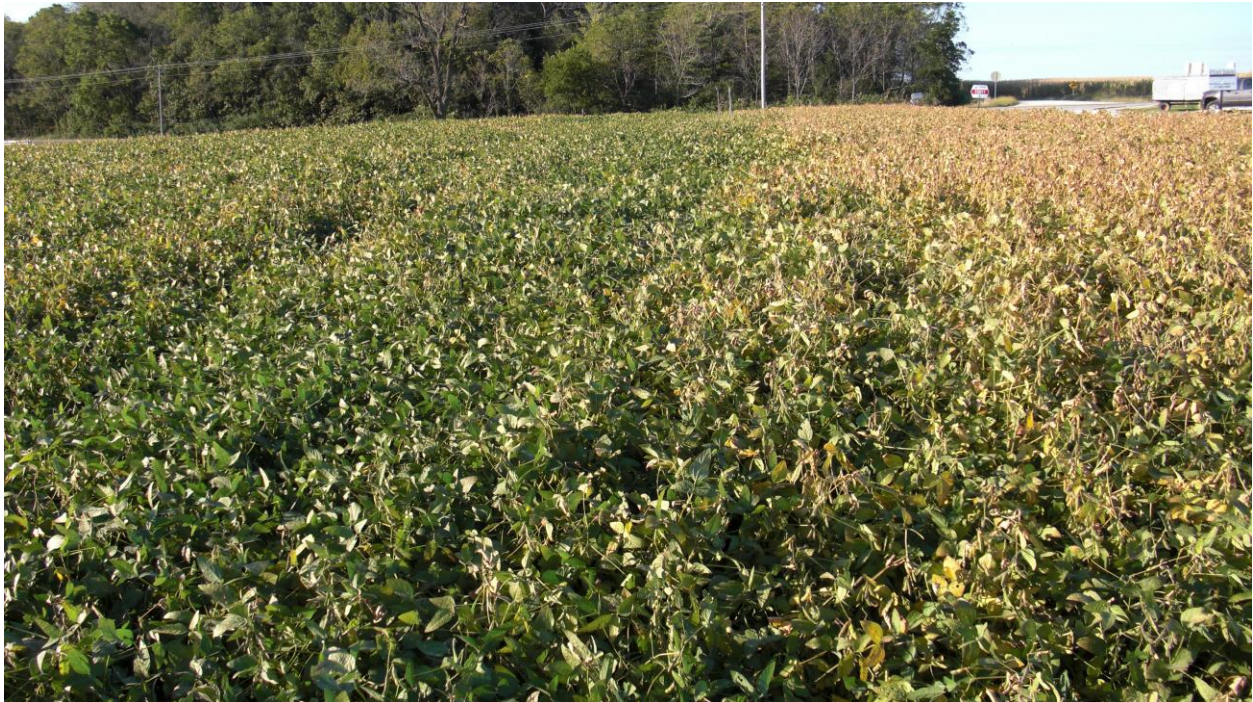
Figure 3. Healthy soybeans (left) where no glyphosate was applied in 2009 compared with severe SDS of the soybeans (right) where glyphosate was applied the Fall of 2009.