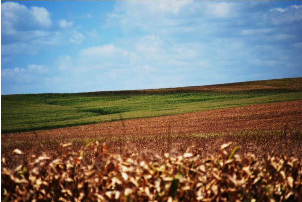
Figure 2. A green non-GMO corn field (upper left) with premature dead and dying RR corn on two sides (upper right and bottom) heavily infected with Goss' wilt, 2010.